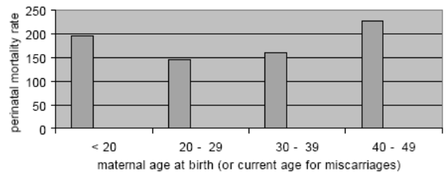
Figure-1: Perinatal mortality rate by maternal age.

Figure-1 3 presents the statistics of perinatal mortality