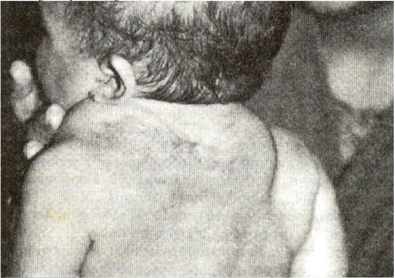
Figure 1. Kasabach-Merritt Syndrome. Pre operative.

A 7 months old baby girl was first admitted to our hospital for epistaxis, and gingival bleeding. She had a history of swelling in the left suprascapular region, left thorax and left shoulder, since birth, which increased gradually in size (Figure 1).