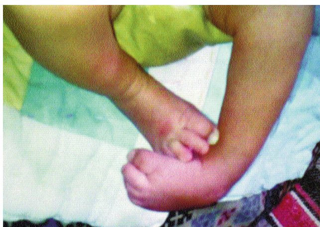
Figure-1: A child with typical club foot deformity involving left foot at presentation.