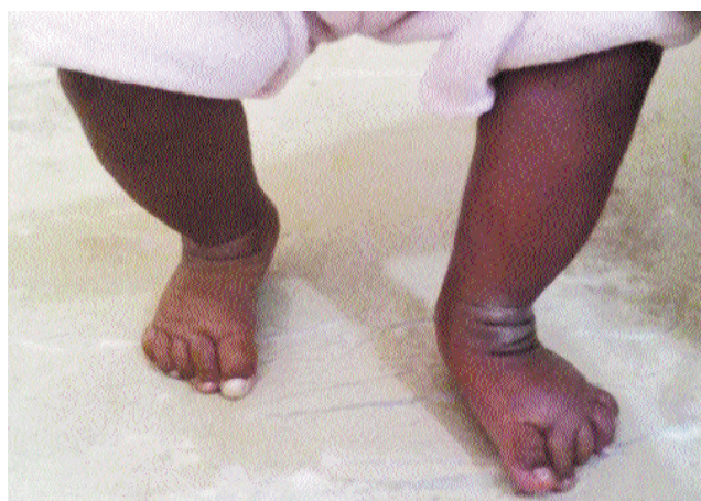
Figure-3: After 4 casts. Same child after completion of treatment with full correction of deformity.

5.58±5.16 weeks (Range 1-28 weeks). Patients had a history of different types of treatment before presentation to our institute. Seven (22.6%) patients had history of serial manipulations alone, 9 (29%) patients had manipulation and below knee casting, 4 (12.9%) patients had above knee casting while 11 (35.5%) patients had no treatment. Mean Pirani score at start of treatment in our institute was 5.71±0.52 (Range 4-6). Average number of casts applied (per patient) to achieve correction was 6.29±0.93 (Range 5-9). Tendo Achilles tenotomy was performed in 90.3% of the patients (28 out of 31 patients). Timing of Tendo Achilles tenotomy was after the 4th cast in 61.3% of the patients, after 3rd cast in 32.3% of the patients and after 5th cast in 6.5% of the patients. We were able to achieve correction (i.e. Pirani score < 1) in 25 (80.6 %) (Figure-1-4). In rest of the 6 cases who developed