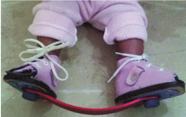
Figure-4: The child in maintenance phase with shoe brace.

recurrent deformity (i.e. Pirani score > 2) 4 patients were lost to follow-up. Two patients who had recurrent deformity were managed successfully with repeat manipulation and casting.