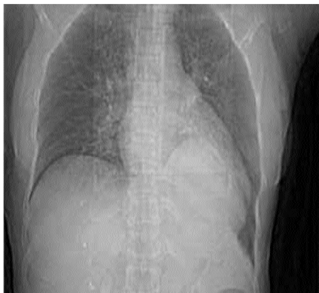
Figure-1: In posterior-anterior (PA) chest radiography, diaphragm eventration and opacity increase are observed at adjacent left paracardiac region.

Correspondence: Edip Gönüllü. Email: edipgonullu@gmail.com