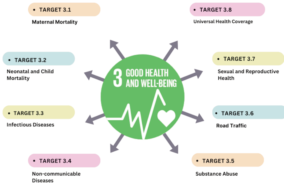
Figure-2: Targets under Goal 3 of Sustainable Developmental Goals

effective along with being easily accessible. AI-powered wearable devices and mobile apps can continuously monitor maternal health parameters, such as blood pressure, heart rate, and foetal movements. Any deviations from normal values can trigger automated alerts, allowing for timely medical interventions, even in remote or underserved areas. Such tools can be of valuable importance in Pakistan which is scarce in its resources in terms of health and facing high maternal mortality rates.