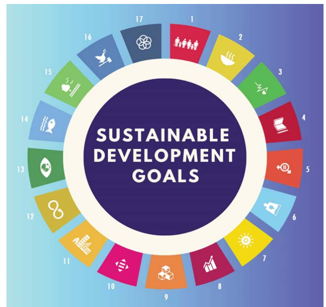
Figure-1: Sustainable Developmental Goals. Current Healthcare Challenges in Pakistan

Looking at the global applicability of AI, many national governments have implemented and regulated AI in various areas through their personalized national action plans. 1 However, such AI implementation programmes have largely been initiated by high-income and upper-middle countries. On the other hand, many developing nations are lagging behind in terms of initiatives for the implementation of AI due to many restraints such as limited resources, financial barriers, a skilled workforce, concerns regarding data privacy, and the digital divide.